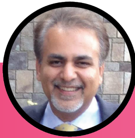
Kosh Suchak Asset Tokenization & ETFs